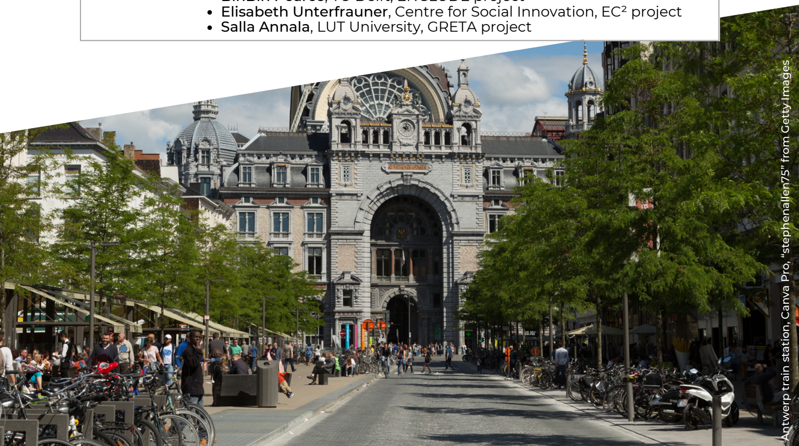
Antwerp train station